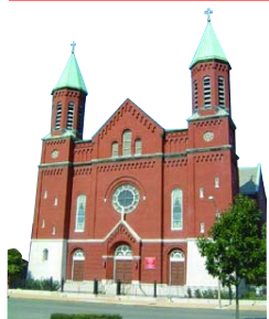
St. Stanislaus Kostka Church