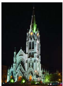
St. Francis Xavier Church