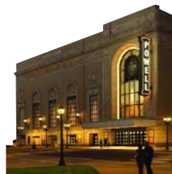
Powell Symphony Hall