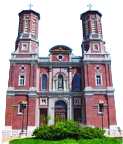
The Shrine of St. Joseph