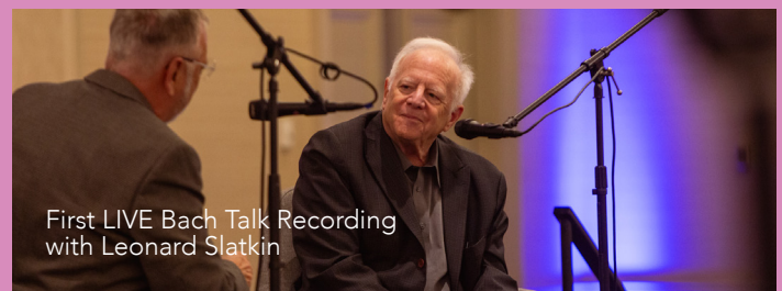
First LIVE Bach Talk Recording with Leonard Slatkin

5,039 downloads with listeners in 64 countries.